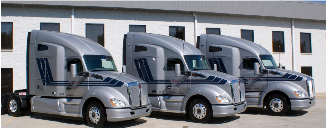
Company Owned Equipment

A.D. Transport Express, Inc. is a privately held transportation and warehousing provider for all general commodity, manufacturing and retail industry sectors. Our mission is to provide our customers with the highest quality transportation, warehouse and supply chain services available.